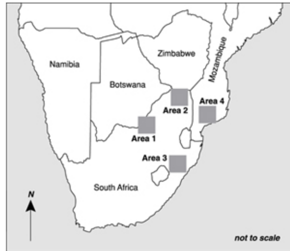
Fig. 2. Location of research areas: Area 1 Mantsie, Lehurutshe District, NorthWest Province, South Africa; Area 2 Khomele, Dzanani District, Limpopo Province, South Africa; Area 3 Mcitsheni, uThukela District, KwaZulu Natal Province, South Africa; Area 4 Nwadjahane, Manjacaze District, Gaza Province, Mozambique.

groups, some of which had overlapping membership that facilitated triangulation of findings. The time spent in the villages, participatory farm visits, plus repeat visits to villages enabled further triangulation of findings. Data analysis consisted of mixed qualitative and quantitative techniques to explore patterns in the livelihood data, coded thematic narratives, and interpretations of participatory and ranking exercises. Such a mixed methods approach is seen as fundamental to challenging received wisdoms about the ‘validity’ and ‘truth’ associated with quantitative analyses and the ‘soft’ and ‘subjective’ accounts associated with qualitative analyses (Philip 1998, Valsiner 2000). Research was discussed with, and documents collected from, district, province, and national level government, research institutes, and NGOs.